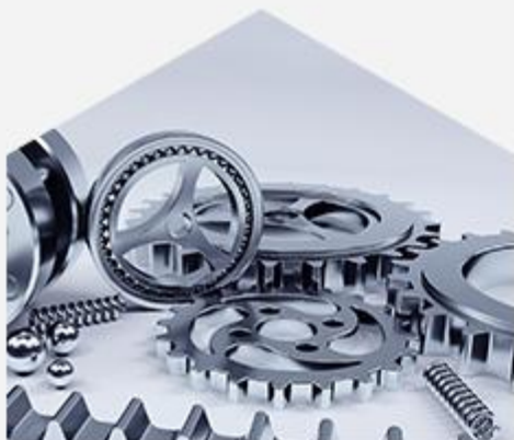
Manufacturing and Processing